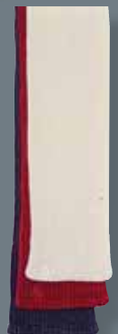
Pure Wool Scarf $58 Red B60000491 Charcoal B60000492 White B60000493