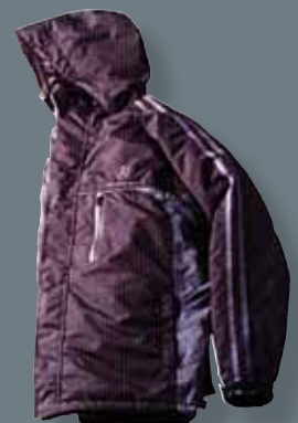
Men's All Weather Jacket M-XXL $168 B60000828-31

All the products in our Winter Collection along with exciting new items are available at Neil Buckby Motors or visit www.mercedes-benz.com.au